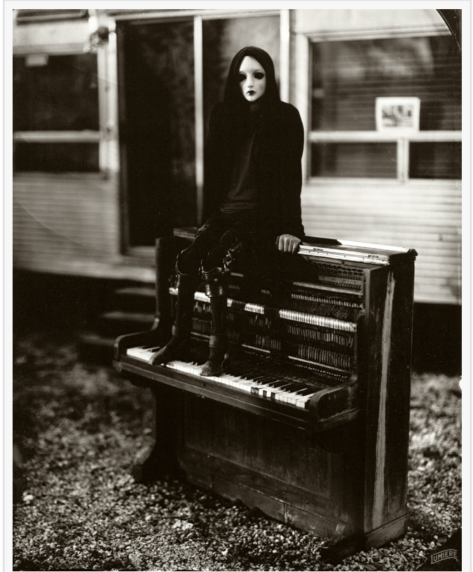
1st Base Runner promotional photo.

This press release can be viewed online at: https://www.einpresswire.com/article/545708610