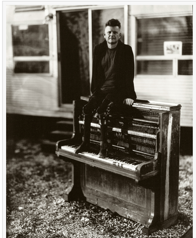
1st Base Runner promotional photo.