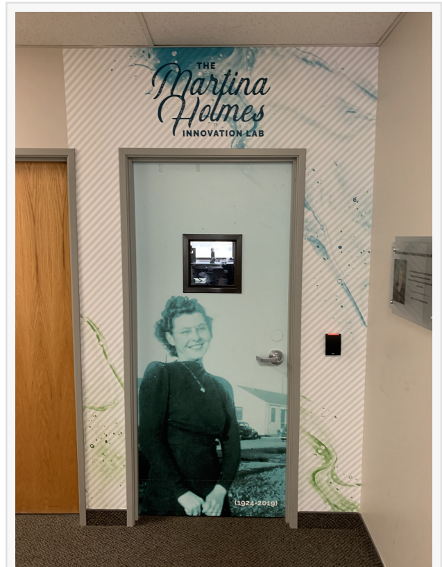
Entrance to The Martina Holmes Innovation Lab

This press release can be viewed online at: https://www.einpresswire.com/article/545725599