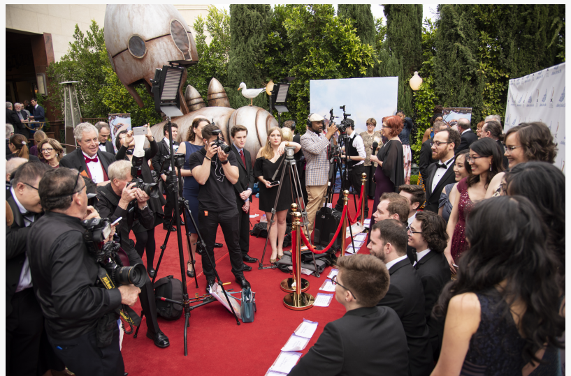
Red carpet at the 35th annual L. Ron Hubbard Achievement Awards Celebration