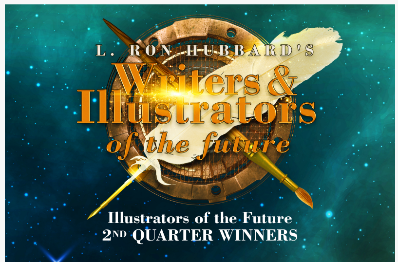
Illustrators of the Future 2nd Quarter Winners Announced for Volume 38

L. Ron Hubbard initiated the Writers of the Future writing contest in 1983 to provide "a means for new and budding writers to have a chance for their creative efforts to be