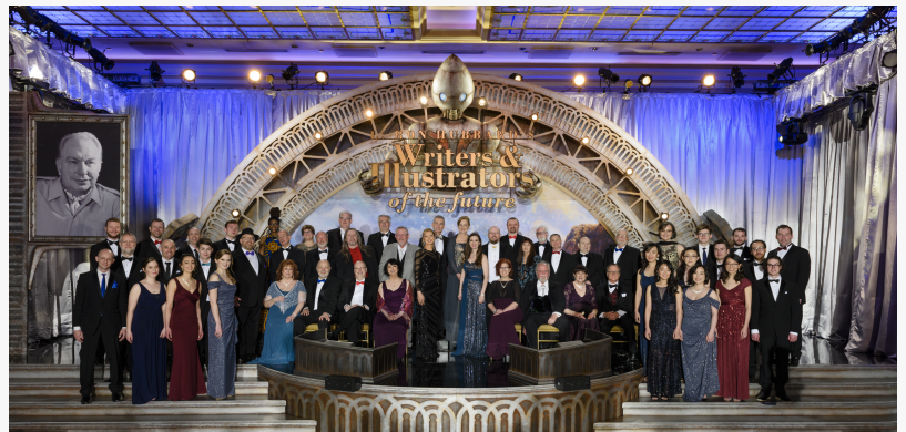
Winners and Judges at the 35th annual L. Ron Hubbard Achievement Awards Ceremony