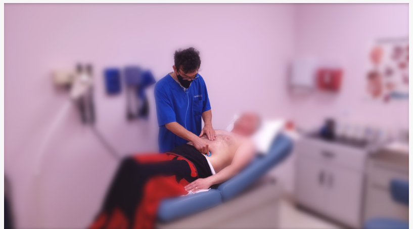
New method of improving intestinal peristalsis