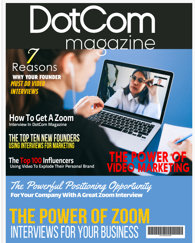
The DotCom Magazine Exclusive Zoom Interview