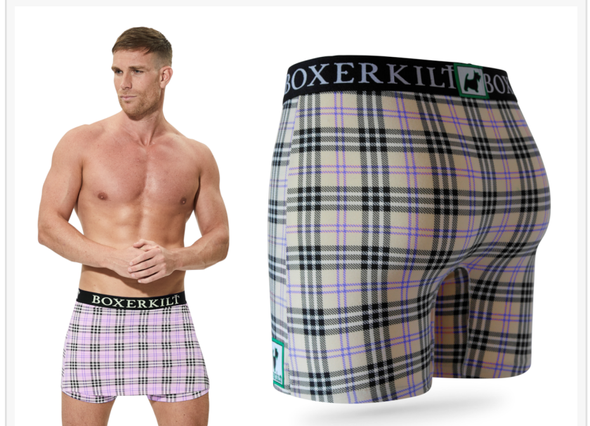
Snug Fitting Just Like Boxer Briefs, but Breezy Cool and Healthy Like Boxer Shorts.