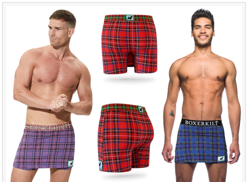
Snug Fitting Just Like Boxer Briefs, but Breezy Cool and Healthy Like Boxer Shorts.

At Boxerkilt, we are looking for publications, broadcasters, and influencers whose readers, viewers, and followers would be interested in independent test reviews. To receive a Boxerkilt for testing, make contact at shop@boxerkilt.com . For more information, visit boxerkilt.com or follow us on Facebook or Instagram.