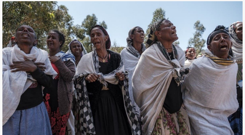
Women mourn after massacre in Dengolat, Tigray, February, 2021