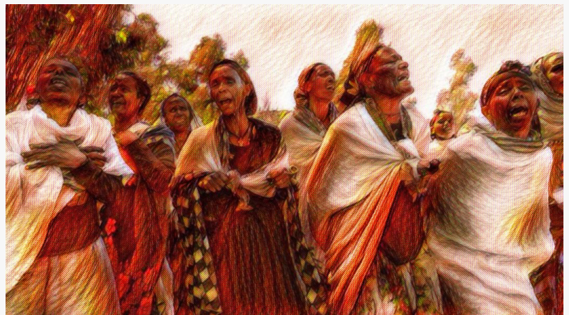
Tigray Women Mourning after Massacre: Desolation