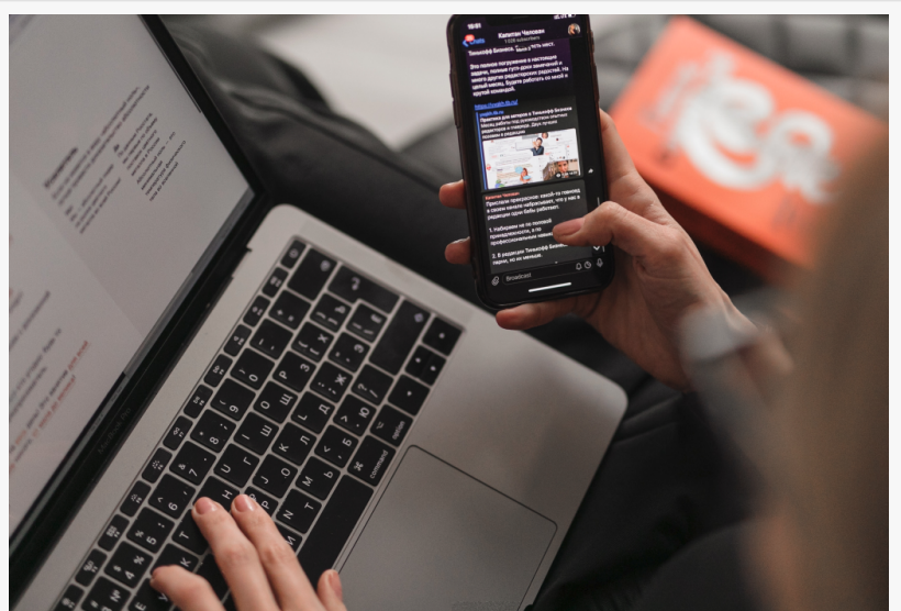
Email Newsletter Automation