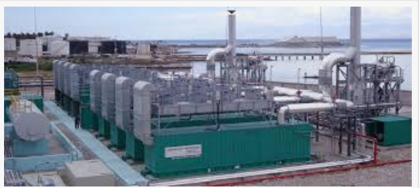
Packaged Power Solution - Hyundai

Also, "The next 10 years will be a critical time to re-determine our country's position in the global battery industry." And "In order to become an unrivaled No. 1 country, we need to focus on public-private capabilities and start responding from now on," he said. Regarding the investment plan of more than 40 trillion won by 2030 announced by private battery companies, the Korean government is