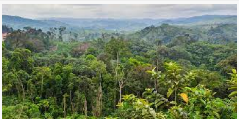
The Congo Rainforest

The South Korean President Jae-In Moon, during his recent visit to LG Energy Solution in Korea, expressed his keenness to support the "K-Battery Industry" and said "The K-Battery Industry is an essential industry that opens the future," adding, "It is an area that needs to take more and make sure South Korea leads this technology globally in the future."