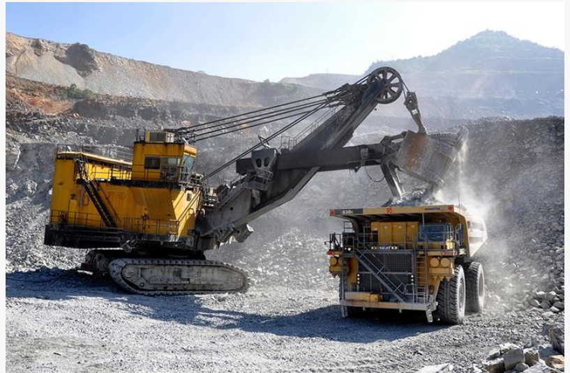
DR Congo Mining