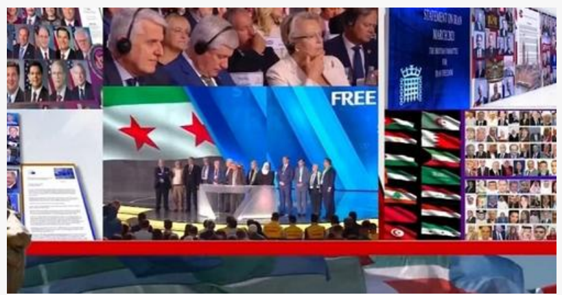
(PMOI / MEK Iran) and (NCRI): European Lawmakers Call For Regime’s Accountability.

The BCIF underlined that a trend of inaction had “emboldened the regime” to undertake more human rights abuses while continuing to promote those officials who had played a leading role in past crimes against humanity. Raisi’s pending ascension to the presidency is a prime example of both of these phenomena, in that his appointment as judiciary chief appears to have been a reward for the service he rendered to the regime as part of the death commissions, while his “election” to the presidency appears to be a similar reward for the ongoing commitment to human rights abuses