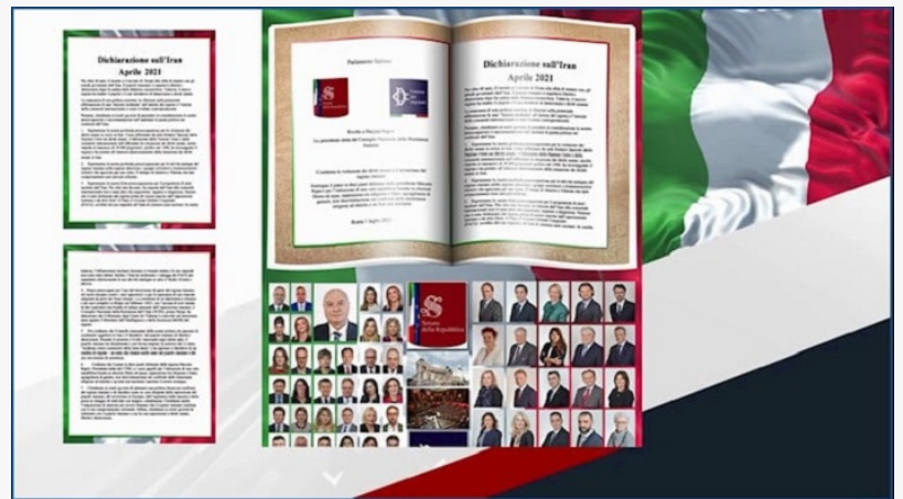
(PMOI / MEK Iran) and (NCRI) Statement of 61 members of the Italian Senate and Parliament on the verge of the Free Iran World Gathering.