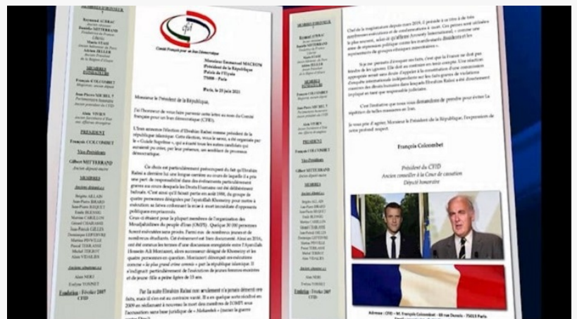
(PMOI / MEK Iran) and (NCRI): Letter of the French Committee for Democratic Iran to the French President.