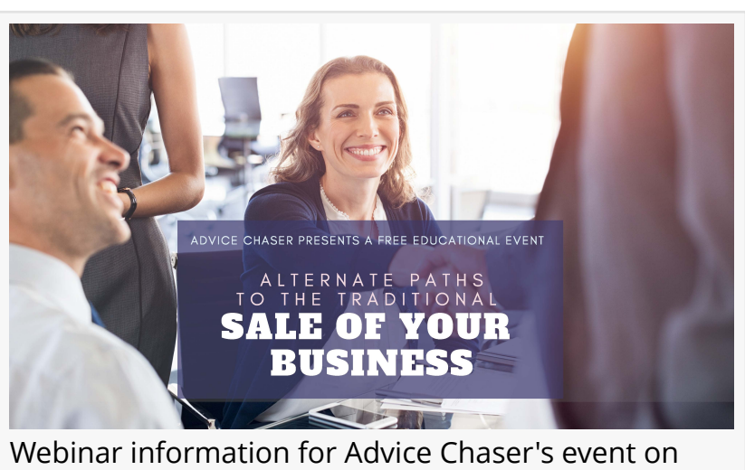
strategies for selling your business

NEW YORK CITY, NEW YORK, USA, July 9, 2021 /EINPresswire.com/ -- Business owners manage their organizations for years, but most don't know where to start when it comes to selling their business. Many small business owners don't know much about the process of selling a business, or what other