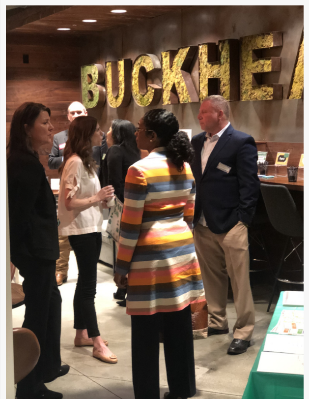
COO Forum, Atlanta Mixer