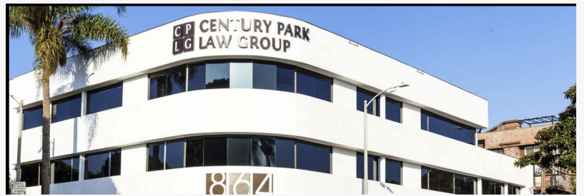
Century Park Law Group Building