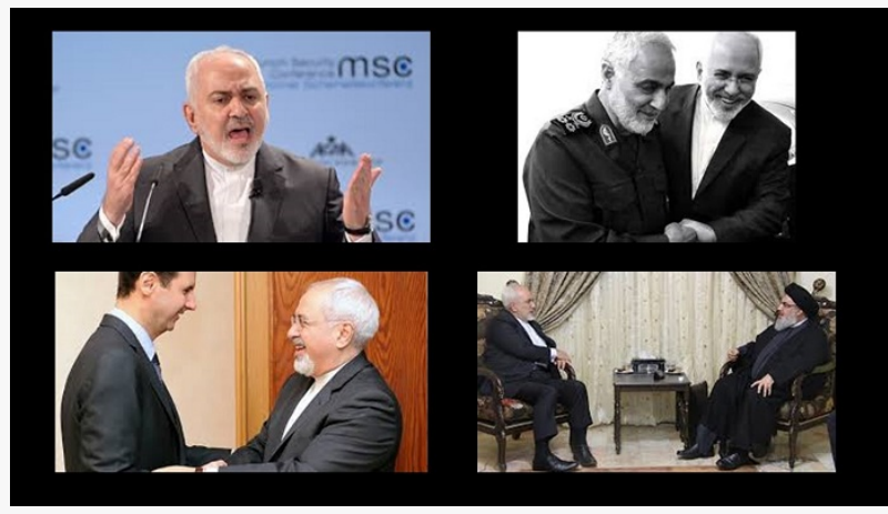
(PMOI / MEK Iran) and (NCRI): Zarif's close relations with top terrorists and notorious dictators.

This press release can be viewed online at: https://www.einpresswire.com/article/546000986