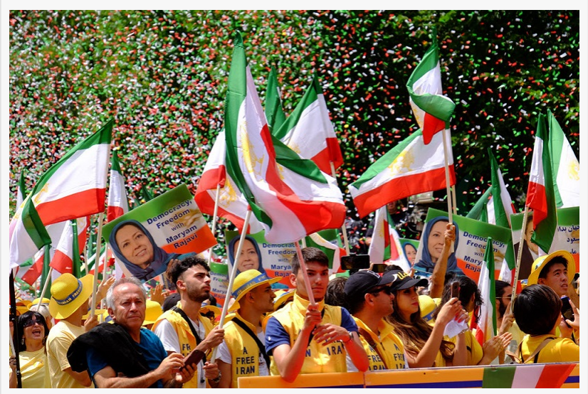
(PMOI / MEK Iran) and (NCRI): The Iranian supporters of The National Council of Resistance of Iran (NCRI), and the People's Mujahedin of Iran (PMOI / MEK Iran). in a Free Iran rally.

(PMOI / MEK Iran) and (NCRI): Free Iran World Summit-2021 commenced with the participation of Iranians and supporters of the resistance from more than 50,000 locations in 105 countries and the presence of thousands of members of the MEK.