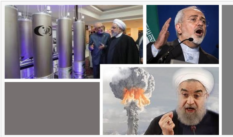
(PMOI / MEK Iran) and (NCRI): Tehran violated the JCPOA first. Iranian regime threatens the international community on Nuclear Deal.