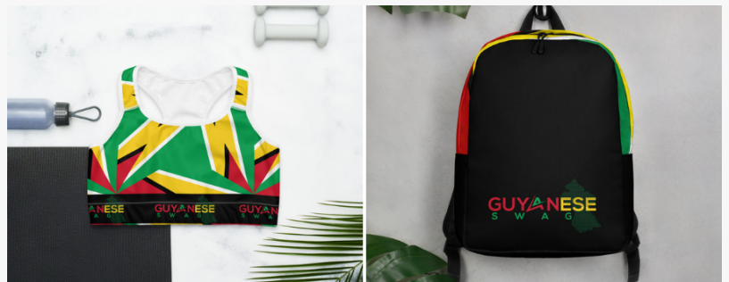
Guyanese Swag Women's Sports Bra and Backpack Collection