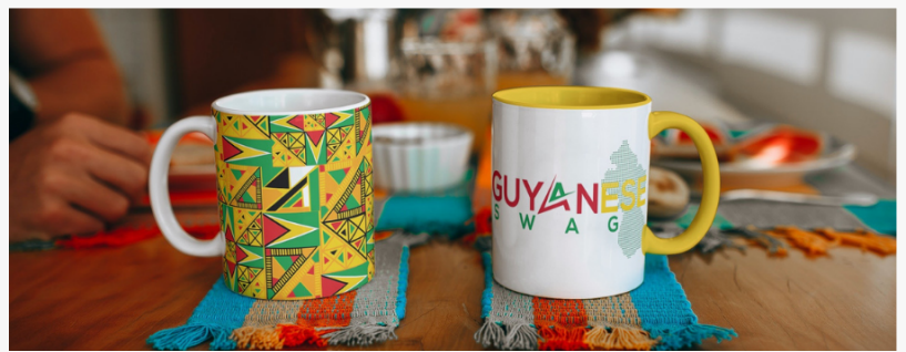
Guyanese Swag Coffee Tea Mug Collection

generation," she says. "It is important that we record our history by telling stories of our past while fostering a community around the globe that is proud to celebrate our origins: where we came from, who we are, and where we are going. One people, one nation, one destiny."