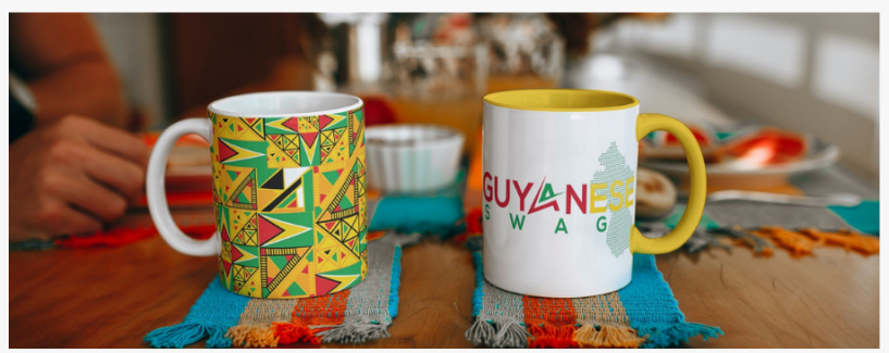
Guyanese Swag Coffee Tea Mug

"The time has come for Guyanese around the world to rise up and proudly celebrate who we are by paving the way for the next generation," she says. "It is important that we record our history by telling stories of our past while fostering a community around the globe that is proud to celebrate our origins: where we came from, who we are, and where we are going. One people, one nation, one destiny."