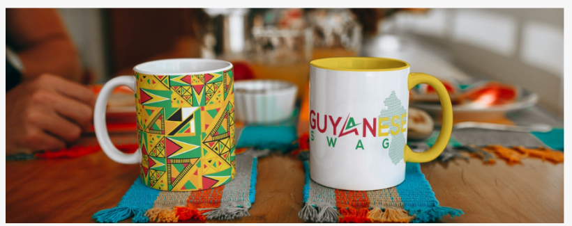
Guyanese Swag Coffee Tea Mug Collection

by paving the way for the next generation," she says. "It is important that we record our history by telling stories of our past while fostering a community around the globe that is proud to celebrate our origins: where we came from, who we are, and where we are going. One people, one nation, one destiny."