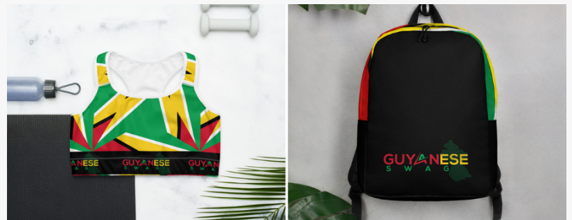
Guyanese Swag Women's Sports Bra and Unisex Backpack From Latest Collection