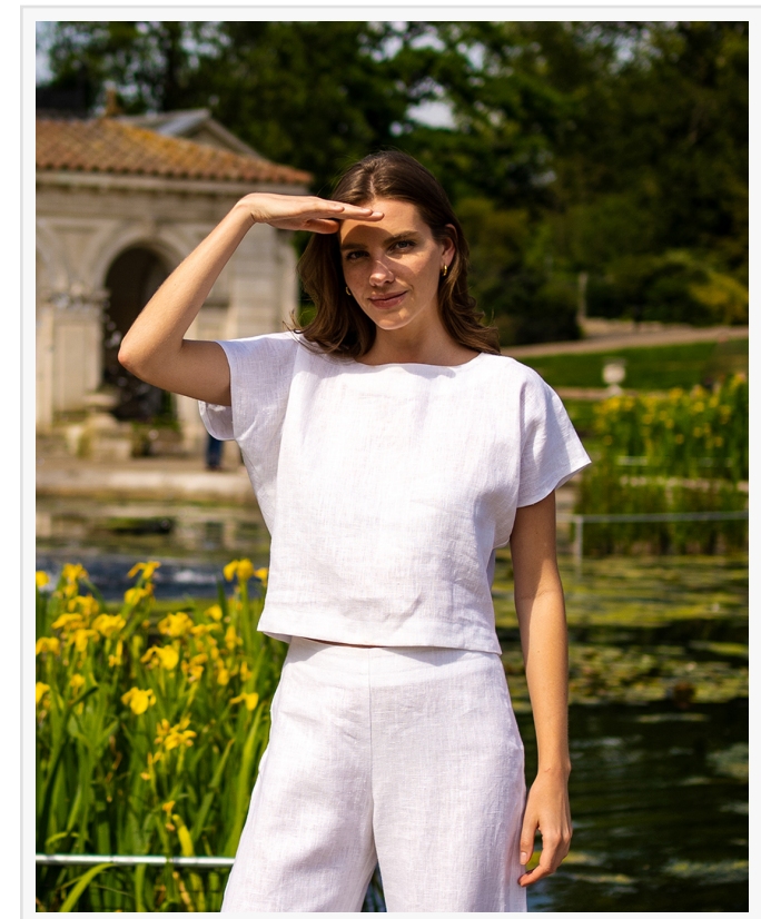
The Bibo cycling and walking collection for women is both functional and elegant, serving in multiple ways

Bibo is a London-based brand of eco-conscious luxury fashion apparel for active women, made from the most sustainable, technically advanced Italian fabrics. Founded by Sylvia Anning, a cycling enthusiast, in London, UK, in 2021, Bibo sources textiles from suppliers with a "zero" environmental impact policy, designing clothing that is both functional and elegant, and that helps women who cycle reach their destination in style-with the full confidence they look fabulous. Bibo offers a timeless capsule wardrobe made in the UK, that serves in multiple ways, from the office to the party, blurring the lines between smart and casual. For more information about Bibo, please visit <a href="https://bibocycle.com/">https://bibocycle.com/</a>