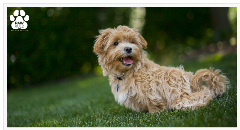
Pawrulz: Online Pet Food | Pets Products Online

GURGAON, HARYANA, INDIA, December 4, 2021 /EINPresswire.com/ -- Pawrulz is offering pet owners a convenient online store for high-quality food products, accessories, and even advice via their Pet Blog. The company offers timely delivery in just 24 to 48 hours for those living in Delhi NCR,