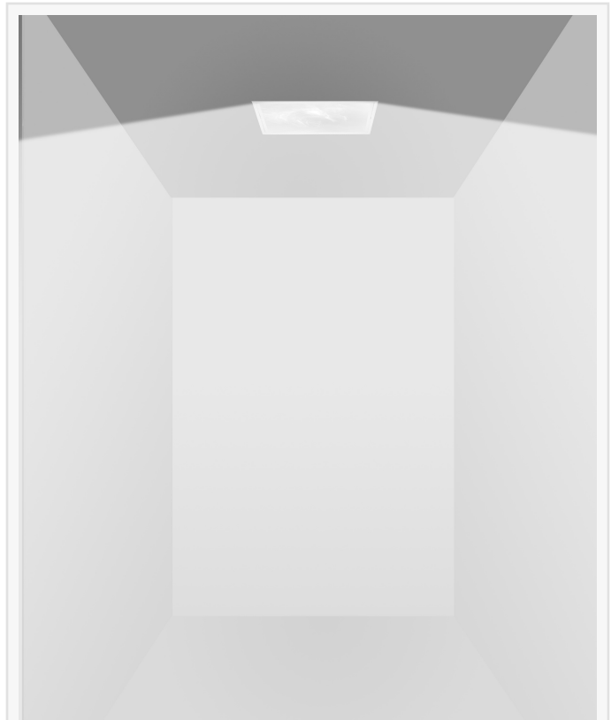
OptiView Superwide provides increased high-angle illumination and extraordinary wall washing.

About Solatube International Solatube International, Inc., widely recognized as the daylighting industry innovator, has earned worldwide acclaim for its unrivaled ability to transform interior spaces with natural light. Based in California, the company is the leading manufacturer and marketer of tubular