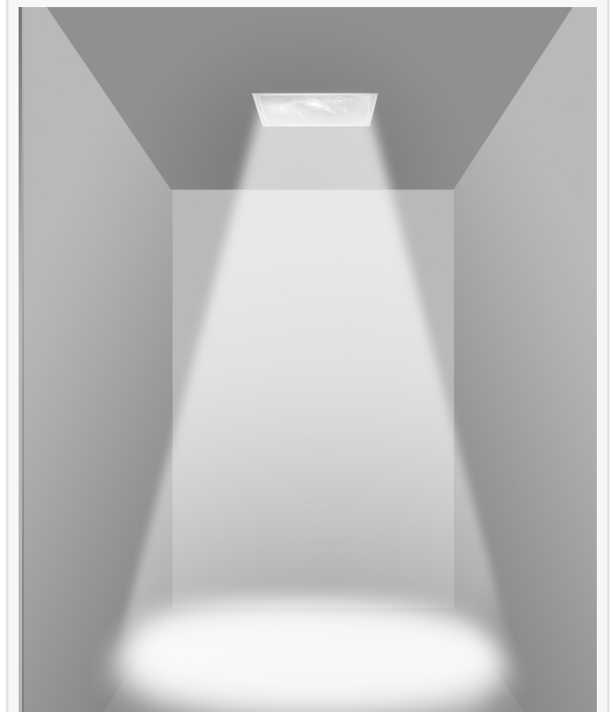
OptiView Narrow allows highlighting of objects.