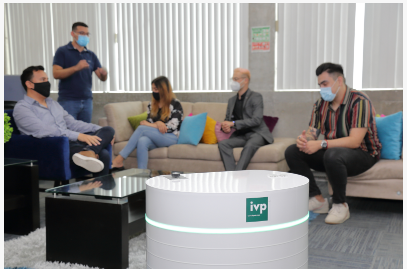
Monterrey Employee Meeting

MONTERREY, MEXICO, July 14, 2021 /EINPresswire.com/ -- Being a best-place-to-work has taken on new meaning. As many contact centers struggle to reopen offices AND agency's call center in Monterrey, Mexico, newly rebranded as AND XP The Experience Professionals, has been investing to upgrade their Employee Experience. They're introducing new employee benefits, adding innovative digital technology, fresh graphic design concepts, collaborative workspaces, and even better air filtration. They have now become the world's first call center to install the Integrated Viral Protection (IVP) Biodefense Indoor Air System™ . The call center installed nine IVP Biodefense Indoor Air System units as part of a $250,000 (US) renovation project in its 15,000 square-foot office in the San Jeronimo 4o Sector neighborhood, to bring more than 250 employees back to work safely.