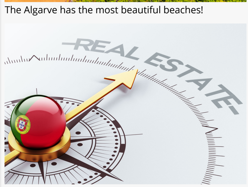
Portugal's Real Estate Market is in High Demand