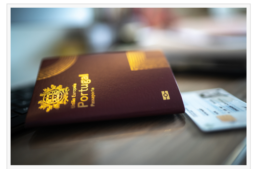
Apply now for the Golden Visa!

However, the rules are changing at the end of this year, with several high-profile areas – including Lisbon, Porto