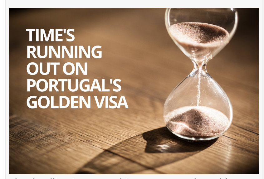
The deadline is approaching on Portugal's Golden Visa!

and much of the coastal regions in the Algarve – being impacted from January 1st, 2022.