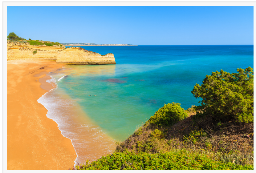
The Algarve has the most beautiful beaches!

Once the application is successful, investors will be granted a Golden Visa for two years. In order to renew the Visa for the next three years, thus completing the required period, they have to visit Portugal for 14 days each year.