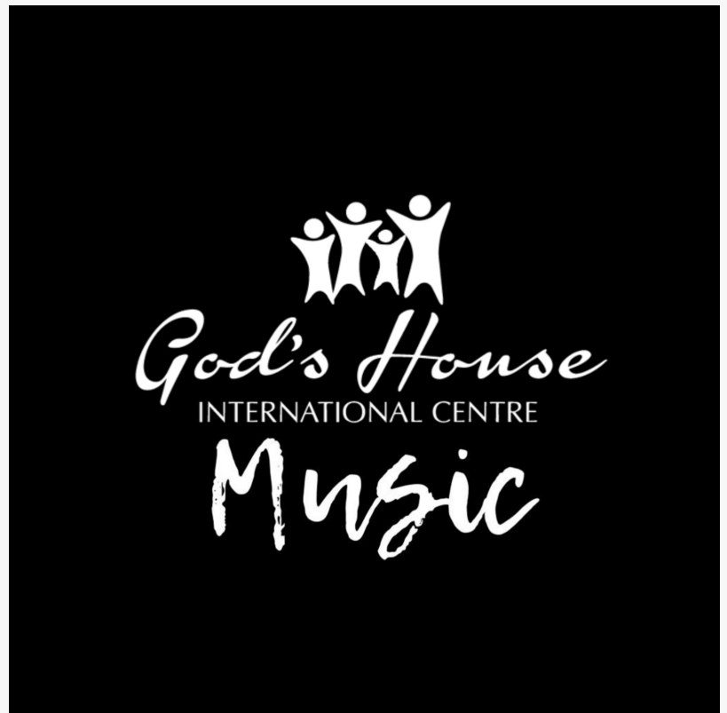
Gods House International Centre Music, Bristol, UK

song. It is worth noting that during the recording process, I was seven months pregnant with my son. This has made the song really special and more applicable to me personally - I knew that it was a timely declaration for all the things I was going through in my life at that point in time.