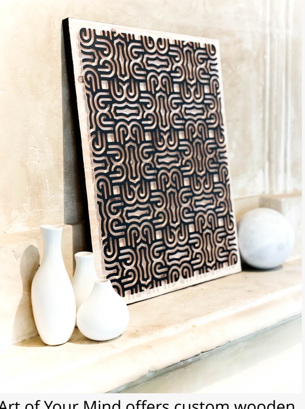
Art of Your Mind offers custom wooden creations.