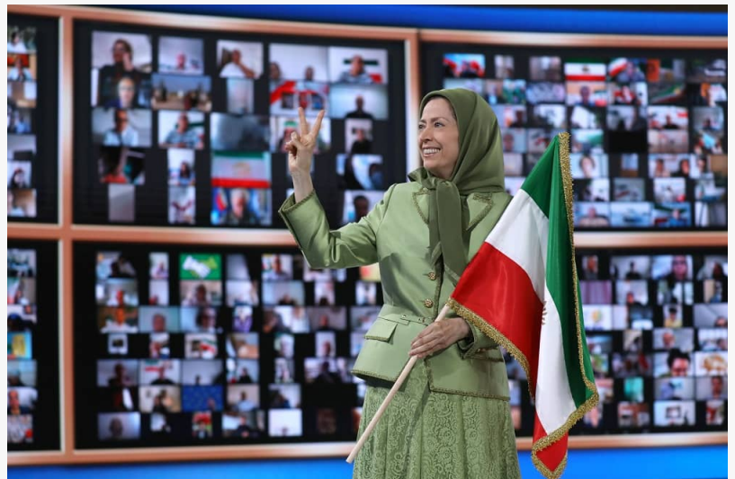
(NCRI) and (PMOI / MEK Iran): Maryam Rajavi, Khamenei, Ebrahim Raisi, and other perpetrators of the 1988 massacre should be put on trial for crimes against humanity and genocide. UN Security Council must set up this trial.