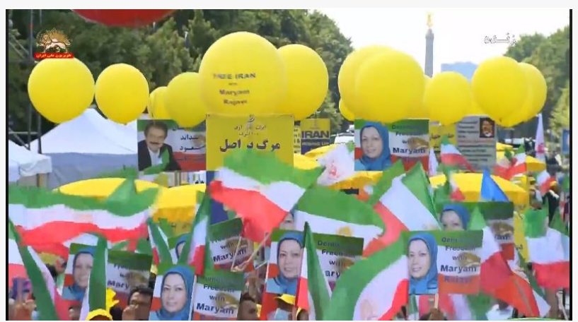
(NCRI) and (PMOI / MEK Iran): The first day of the Free Iran World Summit 2021 - Online summit of Iranians from 50,000 locations in 105 countries, including gatherings in 17 countries.

The combination speaks for itself and hardly requires any other proof to indicate that the regime is in its final phase. Therefore, in the new era, the hostility and enmity between the Iranian regime and society will intensify more than ever before, just as the deposed Shah resorted to declaring martial law and appointing the military General Gholamreza Az'hari as Prime Minister