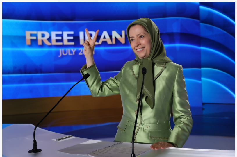
Maryam Rajavi: Installing Raisi as president a sign of the regime's final stage, fear of uprising, entrenchment, and intensified internal purge.

Sen. Robert Menendez, chairman of the Senate Foreign Relations Committee, said that Ebrahim Raisi "won a sham election after the regime cleared the field of any credible challenger in which a majority of eligible voters showed their disgust by refusing to participate, leading to the lowest voter turnout since 1979... It is a further indictment of his rule that he would not only endorse but tip the scales in favor of a man like Raisi becoming president of Iran. A man who is actively involved in the forcible disappearance and extrajudicial killing of thousands of Iranian dissidents in 1988. A man who Amnesty International's Secretary General Agnès Callamard, recently said must be investigated for crimes against humanity."