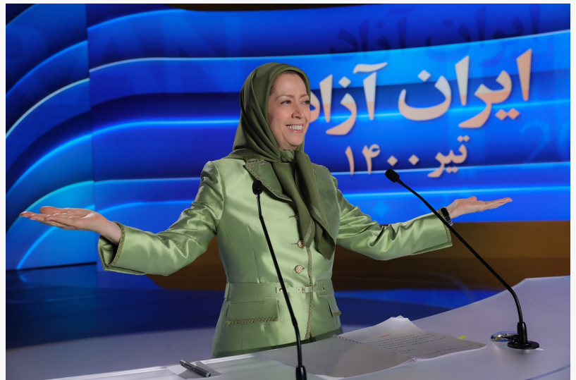
Maryam Rajavi: Installing Raisi as president a sign of the regime's final stage, fear of uprising, entrenchment, and intensified internal purge

PARIS, FRANCE, July 14, 2021 /EINPresswire.com/ -- On Saturday, July 10, 2021, the three-day Free Iran World Summit-2021 commenced with the participation of Iranians and supporters of the Iranian Resistance from more than 50,000 locations in 105 countries, as well as thousands of members of the Mujahedin-e Khalq (MEK/PMOI) residing at Ashraf 3 in Albania.