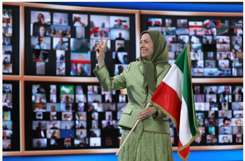
Maryam Rajavi: Khamenei, Ebrahim Raisi, and other perpetrators of the 1988 massacre should be put on trial for crimes against humanity and genocide. UN Security Council must set up this trial.