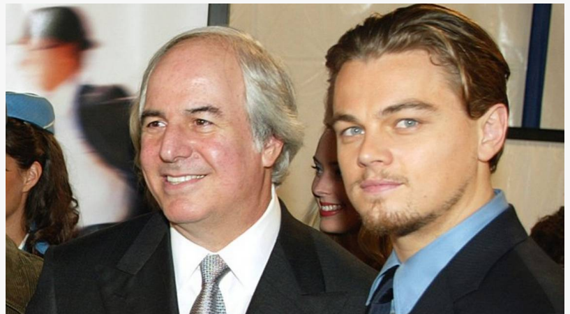
Frank Abagnale (left) Leonardo DiCaprio (right)