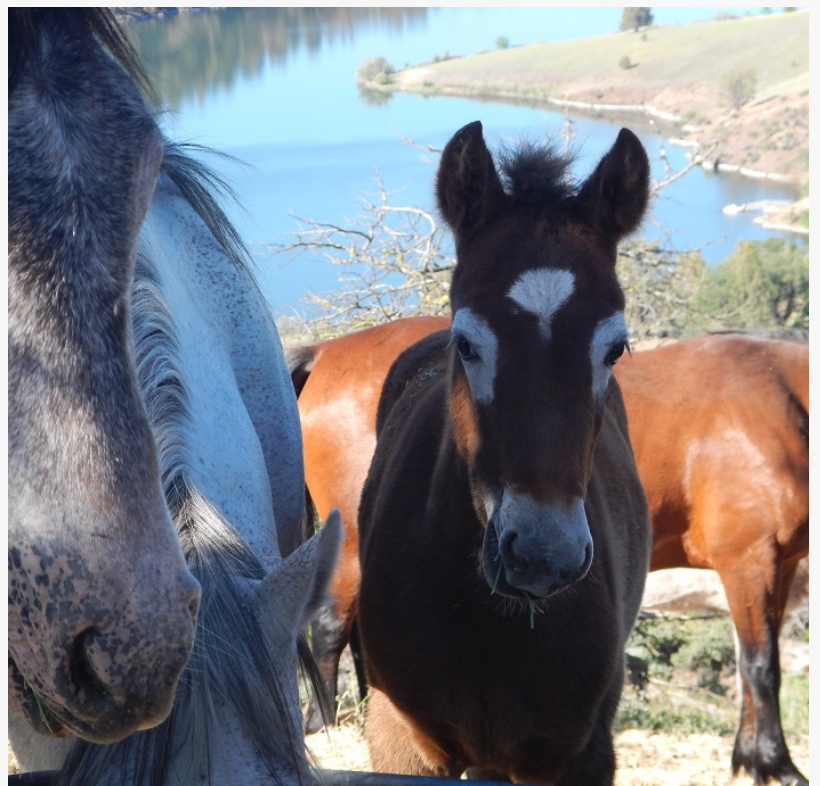
One of the amazing wild horses at Wild Horse Ranch

#WildHorses, #AshleyAvis, #WilliamESimpsonII, #WHFB, #WinterstonePictures,