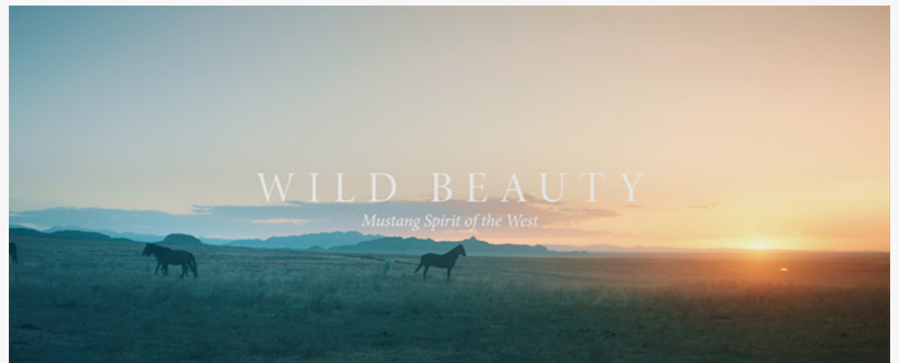
Wild Beauty - Spirit of the Mustang West