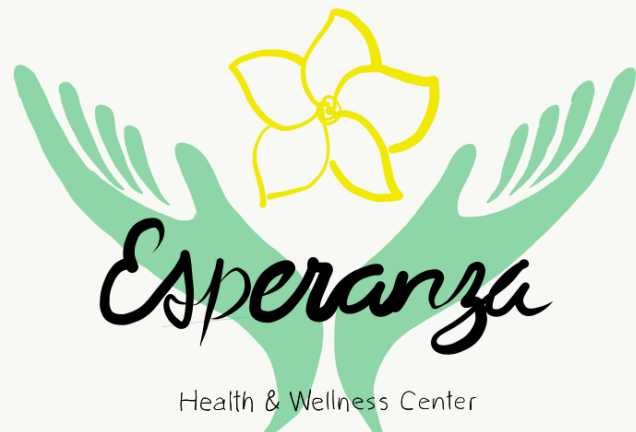
Esperanza Health and Wellness Center logo