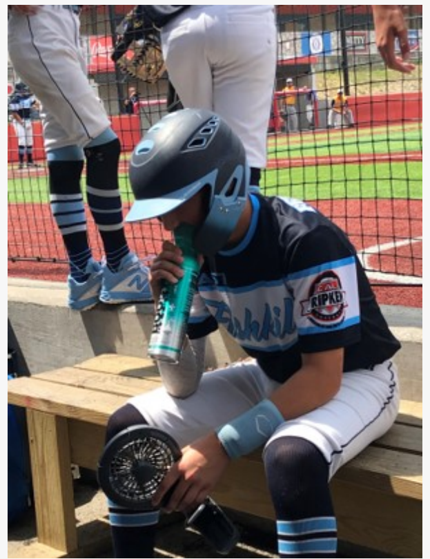
Youth baseball players from East Fishkill, NY implement Boost Oxygen while competing in the Cal Ripken World Series.

This press release can be viewed online at: https://www.einpresswire.com/article/546415199