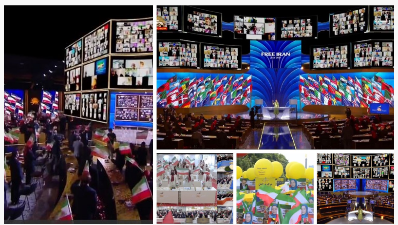
(NCRI) and (PMOI / MEK Iran): Free Iran World Summit 2021 - Online summit of Iranians from 50,000 locations in 105 countries, including gatherings in 17 countries.

The mullahs' regime will never give up acquiring nuclear weapons, export terrorism, and warmongering in the region. Therefore, as the main threat to peace and security, it must be subjected to international sanctions under Chapter Seven of the UN Charter.