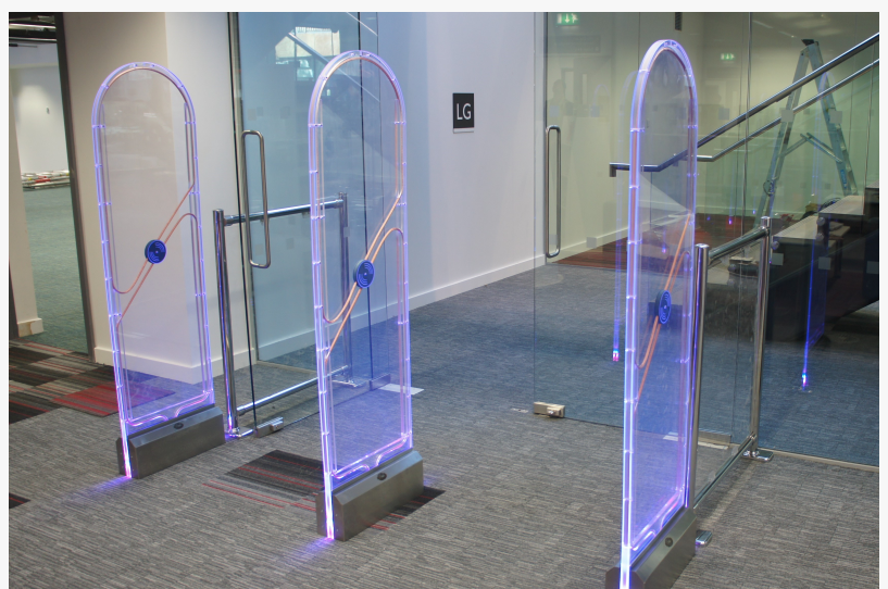
secureIT p-Series RFID library security solution