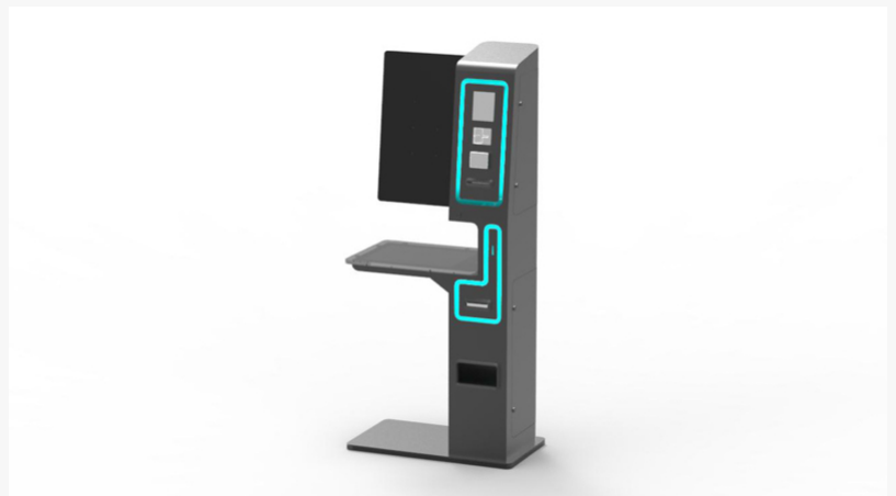
serveIT EYRE library self service checkout kiosk

This press release can be viewed online at: https://www.einpresswire.com/article/546455604