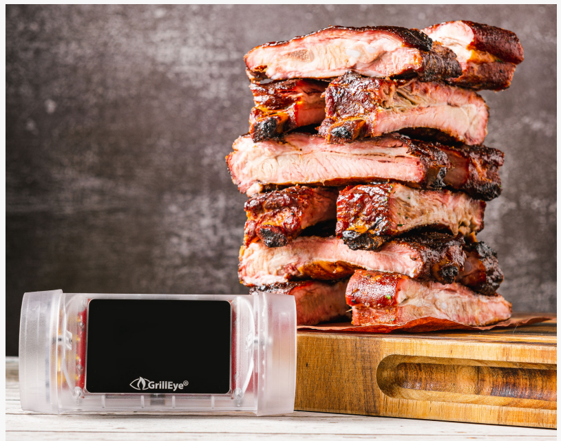
Fall-off-the-Bone Ribs made easy with your GrillEye® Max