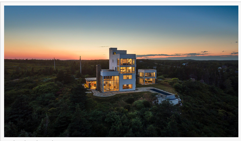
Whalesback Estate, 137 Gannet Lane, Duncans Cove, Nova Scotia

NEW YORK, NEW YORK, UNITED STATES, July 16, 2021 /EINPresswire.com/ -- Perched atop rugged granite cliffs overlooking the Atlantic, <u>Whalesback Estate</u>, located at 137 Gannet Lane, will auction next month via Concierge Auctions in cooperation with Mariana Cowan and lan Smith of the Cowan-Smith Team at