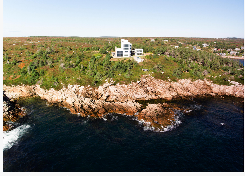
Seamless outdoor entertaining with ocean view infinity pool

Squadron invite sea adventures with Atlantic Canada's largest learn-to-sail program. Cross into Halifax proper to wander its nearly two-and-a-half-mile boardwalk featuring incredible shops, fine dining and, of course, iconic ocean views. Whether exploring waterfront boardwalks, scenic drives, sailing cruises, or more, Nova Scotia provides seamless access to ocean waters, just 35 minutes away in any direction.