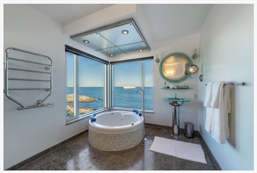
Contemporary masterpiece with incredible ocean views

Duncan's Cove, set just 11 miles from bustling Halifax, is a rural oasis on the rugged Atlantic coastline yet offers vibrant nightlife, a plethora of restaurants, and a rich historic experience. Perched hilltop, the Halifax Citadel National Historic Site, one of Canada's most visited national historic locations, overlooks the Halifax Harbour where Crystal Crescent Beach and its three crescent moons of white sand await to be explored. Its nature reserve boasts one of the best coastal hikes in the Halifax Regional Municipality. Gaze over the waters to watch for whales, seals, and staggering ships year-round. Purcell's Cove Marina and the Royal Nova Scotia Yacht