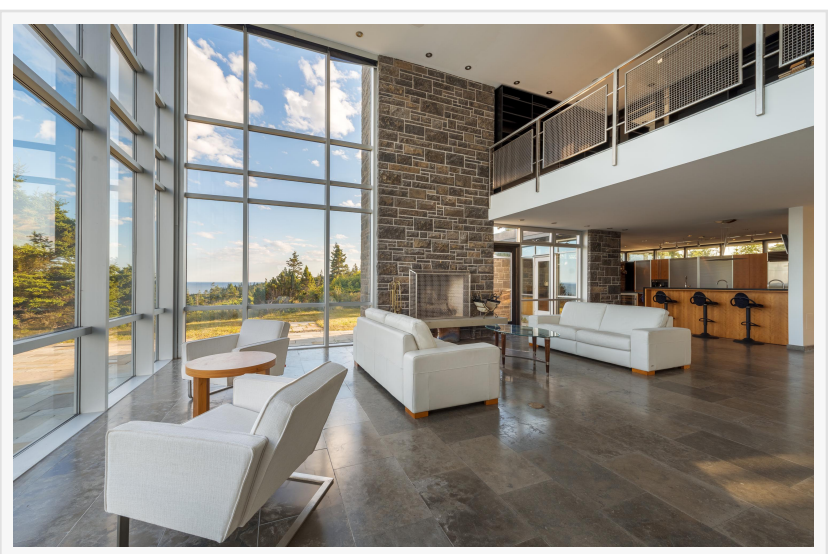
Great room with 20' walls of glass and limestone fireplace

Additional features include portueguese limestone flooring throughout; formal dining room with marble feature wall, chic lighting, and ocean views; spacious kitchen with oversized island, second prep island, light cherrywood and sleek steel cabinets, professional appliances, and soapstone countertops; a whole-floor master suite with sweeping ocean views, wet bar, and five-piece spa-like ensuite including sunken circular Japanese-inspired soaker tub made for