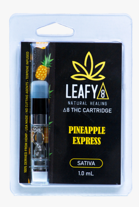
Leafy8 Pineapple Express Delta-8 THC Vape Cartridge

We had a niche to fill in our area, and so it began.