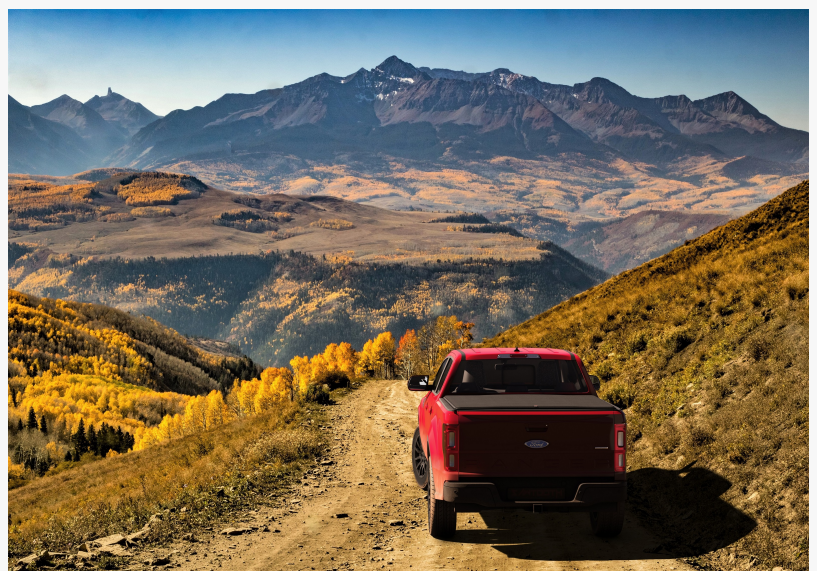
Ford Ranger using a Sawtooth STRETCH Tonneau

This press release can be viewed online at: https://www.einpresswire.com/article/546478833