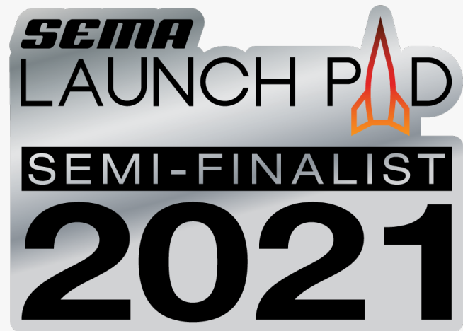
SEMA Launch Pad 2021 Semi-Finalist

Shop the STRETCH Tonneau and learn more about Sawtooth at www.sawtootht.com .