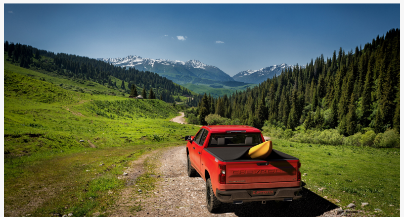
Chevy Silverado Securing Kayak

About Sawtooth: Sawtooth Tonneau is a top manufacturer of premium, US-made innovative cargo management products that allow users to quickly load, secure, and protect cargo for