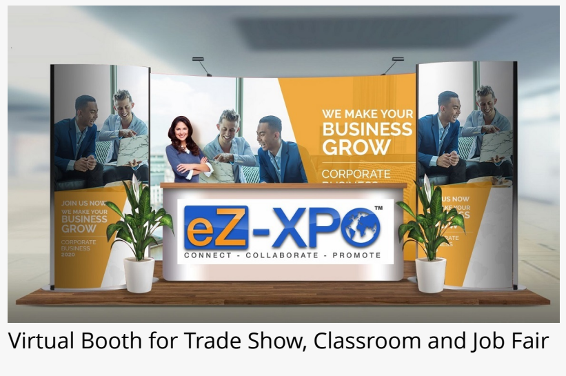
Virtual Booth for Trade Show, Classroom and Job Fair