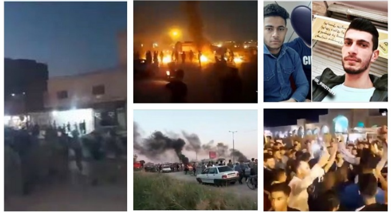
(NCRI) and (PMOI / MEK Iran): Youth block highways; State Security Force opens fire, killing a 26-year-old, wounding many others.

Mrs. Maryam Rajavi , the President-elect of the National Council of Resistance of Iran (NCRI), saluted the arisen people of Ahvaz and Khuzestan Province who, in dire need of water and freedom, has come to the streets and chant 'we will not accept humiliation.' Mrs. Rajavi called on all youths to rush to the aid of the people of Khuzestan, especially those wounded. She said that opening fire on unarmed residents and the martyrdom of a young man in Shadegan again demonstrated that as long as the plundering mullahs remain in power, poverty, unemployment, and disease will continue. The