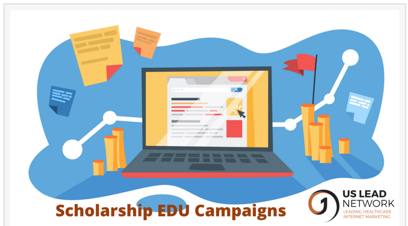
Best Scholarship EDU Link Campaign