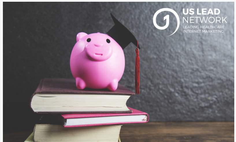
Scholarship .edu link building

This press release can be viewed online at: https://www.einpresswire.com/article/546589351