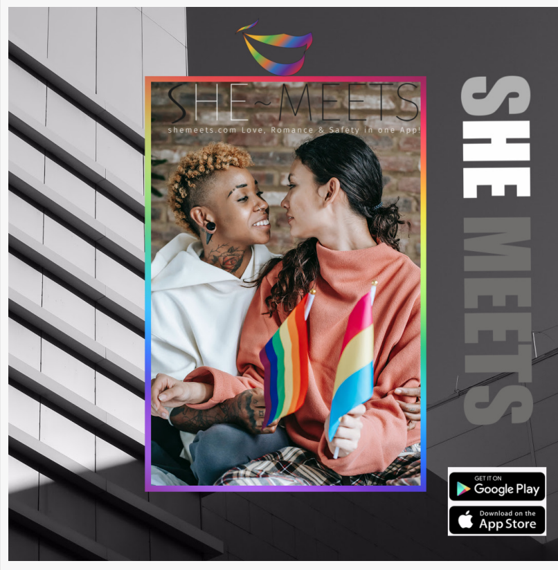
SHE Meets Dating App LGBTQ Finding Love