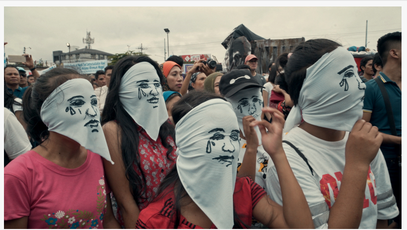
Still taken from the documentary, ' Aswang ', now streaming on iwonder

iwonder is a documentary and current affairs streaming service, curating the world's best feature