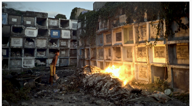
Still taken from the documentary ' Aswang ', now streaming, only on iwonder