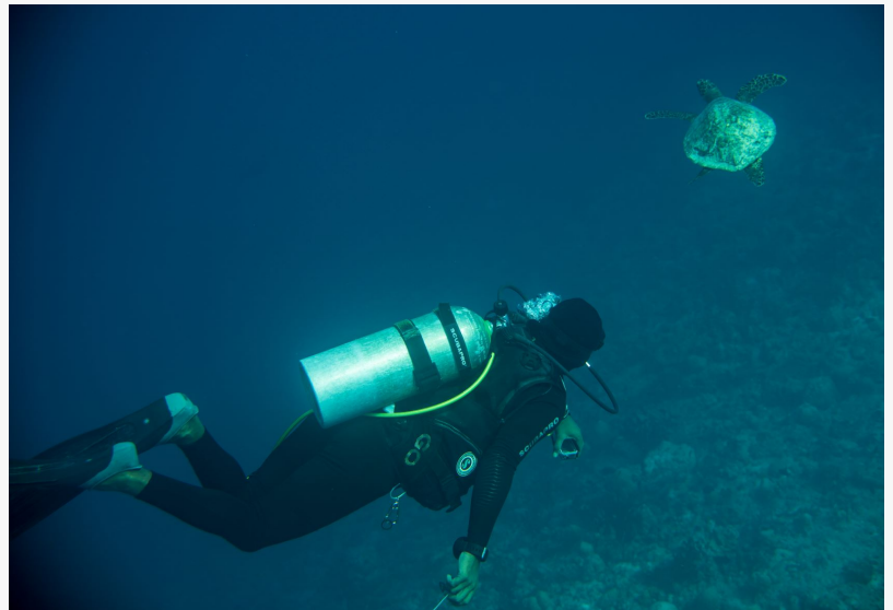
Ellaidhoo Maldives by Cinnamon Diving