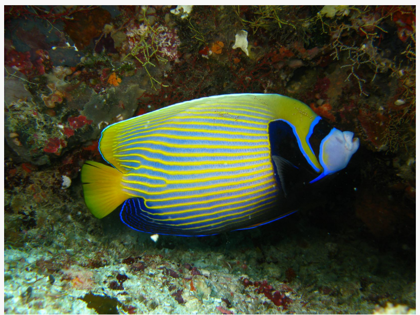
Ellaidhoo Maldives by Cinnamon House Reef

MALE, NORTH ARI ATOLL, MALDIVES , July 22, 2021 /EINPresswire.com/ -- Ellaidhoo Maldives by Cinnamon , located in the North Ari Atoll is an iconic resort belonging to the Cinnamon Hotels & Resorts chain, and a prime diving destination in the world.