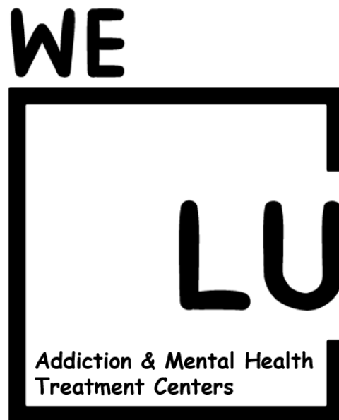
We Level Up Treatment Center Review