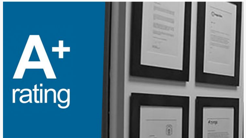
A+ Rated We Level Up Treatment Center Rehab Facilities

We're delighted to announce that our BBB profile lacks a single customer complaint. We Level Up