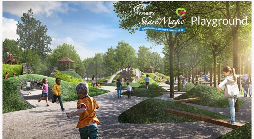
Unity Park Greenville SC Artificial Turf

Plans for Unity Park’s playground zone have been announced by the city and will cover over 30,000 square feet. Playground areas will include custom slide mounds, rope climbing