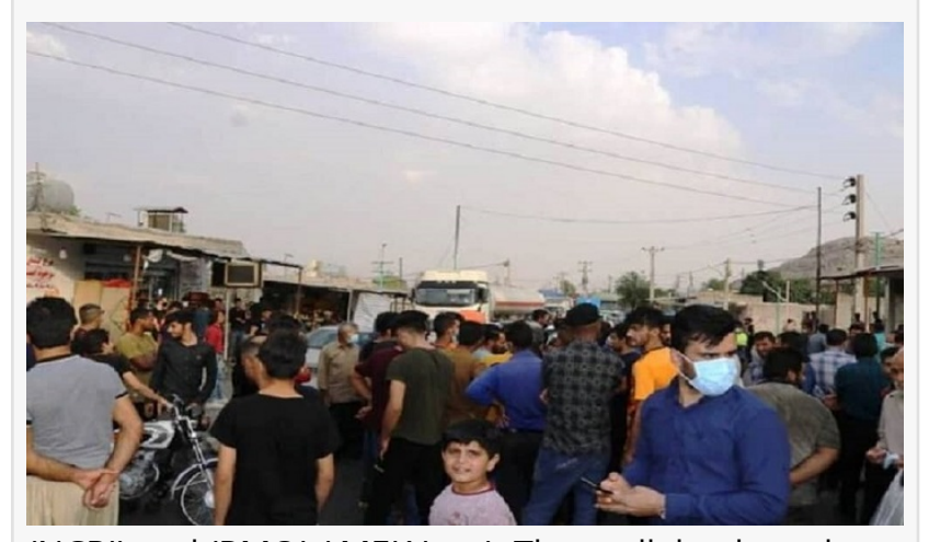
(NCRI) and (PMOI / MEK Iran): The mullahs deny the people water, power, bread, housing, and vaccines to provide for the unpatriotic nuclear and missile projects and their warmongering in the region.