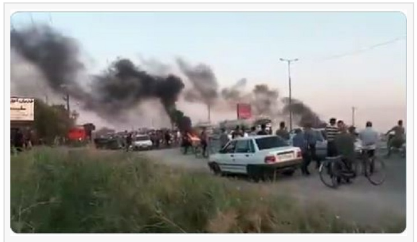
(NCRI) and (PMOI / MEK Iran): The people of Susangard protested by closing the main road to Ahvaz.

In 1988, Raisi was a major participant in a massacre of political prisoners which left over 30,000 people dead, Majority of the victims were either members or supporters of the People's