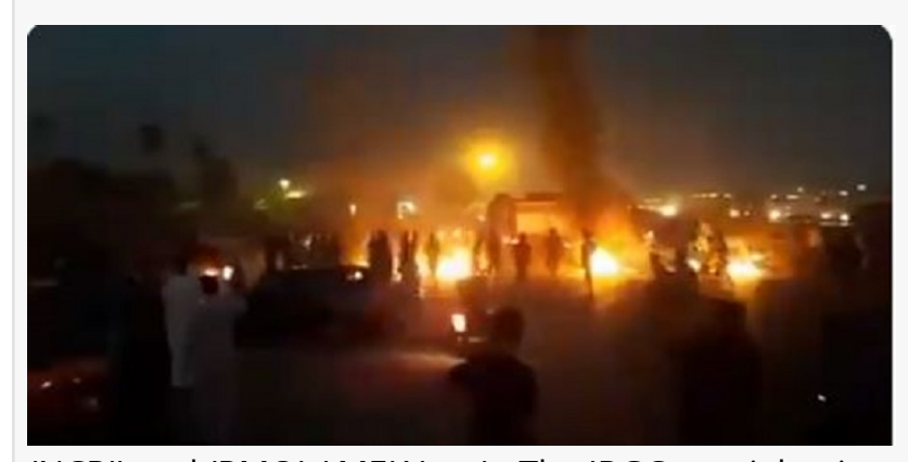
(NCRI) and (PMOI / MEK Iran): The IRGC special unit entered Kut Abdullah and the roads leading to the city were closed by the police.