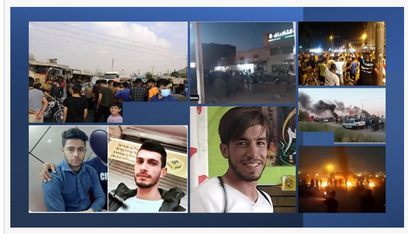
(NCRI) and (PMOI / MEK Iran): So far, three youths have been killed and several others wounded by direct fire from repressive forces.