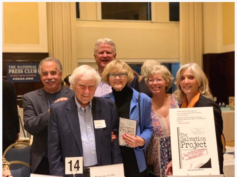
Gala book launch at Washington, D.C.'s National Press Club