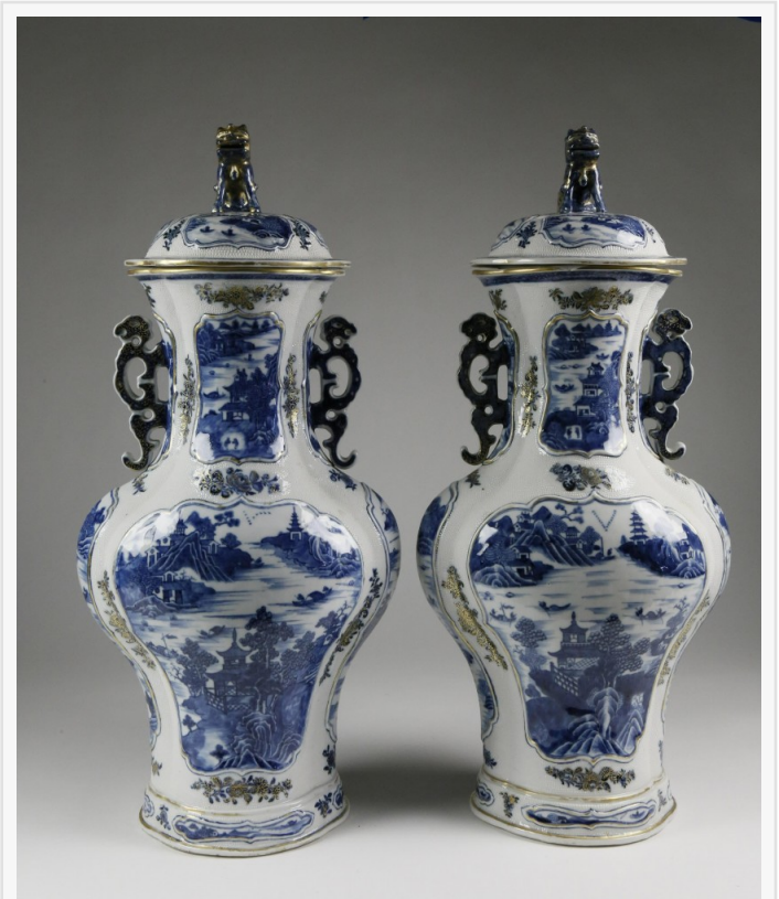
Chinese Export pair of underglaze blue baluster vases with covers, circa 18th century, 21 inches tall, with applied leopard handles, a foo lion finial and gilt detailing. Estimate: $25,000-$35,000.

Fine American furniture including untouched highboys, chest on chest, Windsor writing chairs, desks, bureaus, games tables, Tennessee sugar chest, Philadelphia cupboard will delight the