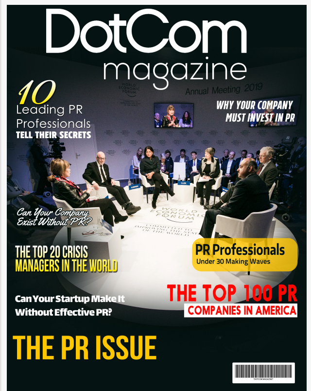
The DotCom Magazine Entrepreneur Spotlight Show