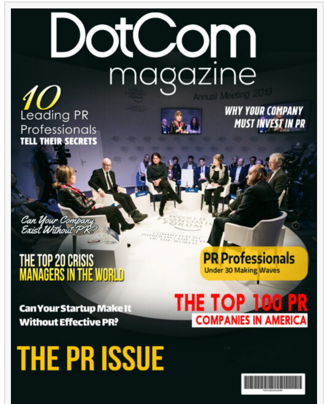
The DotCom Magazine PR Issue

DotCom Magazine is a leading news platform providing fascinating interviews with news makers, thought leaders, and entrepreneurs. DotCom Magazine is the leader in putting people with insatiable entrepreneurial spirit at the forefront of every story it publishes. The Entrepreneur Spotlight Interview Video Series looks at business through the lens of a successful entrepreneur's mindset. The Entrepreneur Spotlight Series has included many high-profile leaders, including Inc500 founders, Ted Talk presenters, ABC Shark Tank participants, venture backed visionaries, high profile CEO's and Founders, and many other wonderful thought leaders and entrepreneurs. DotCom Magazine covers Founders and CEO's making a difference. Regardless of who the entrepreneur is, where they live, or what they are doing, if it is interesting and newsworthy, DotCom Magazine covers it. In selecting entrepreneurs for this important video series, we consider the newsworthiness of the story and what our readers want to learn about. If something is important to our readers, it is important to DotCom