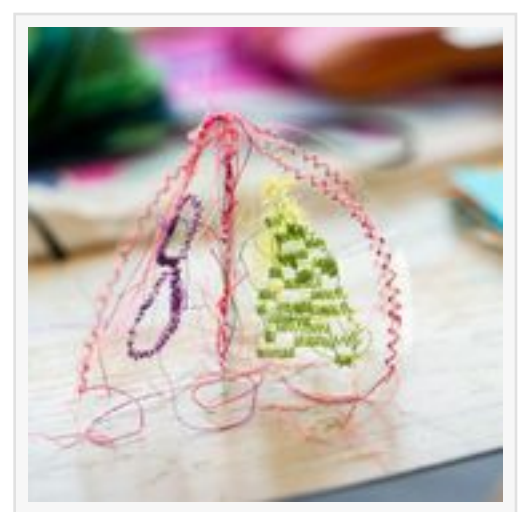
"Daily Thread" - A miniature one-off paper ephemera that comes with an accompanying fortune.

This press release can be viewed online at: https://www.einpresswire.com/article/546891430